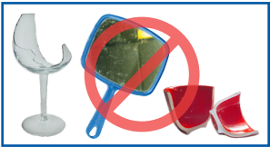
Glass dishes, window glass, and ceramics