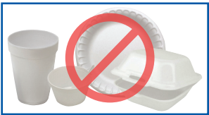
Plastic foam (Styrofoam™)