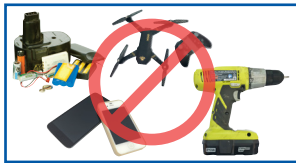
Electronics and batteries