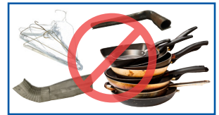
Random metal items