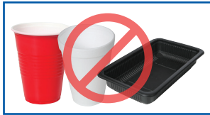
#6 and black plastics